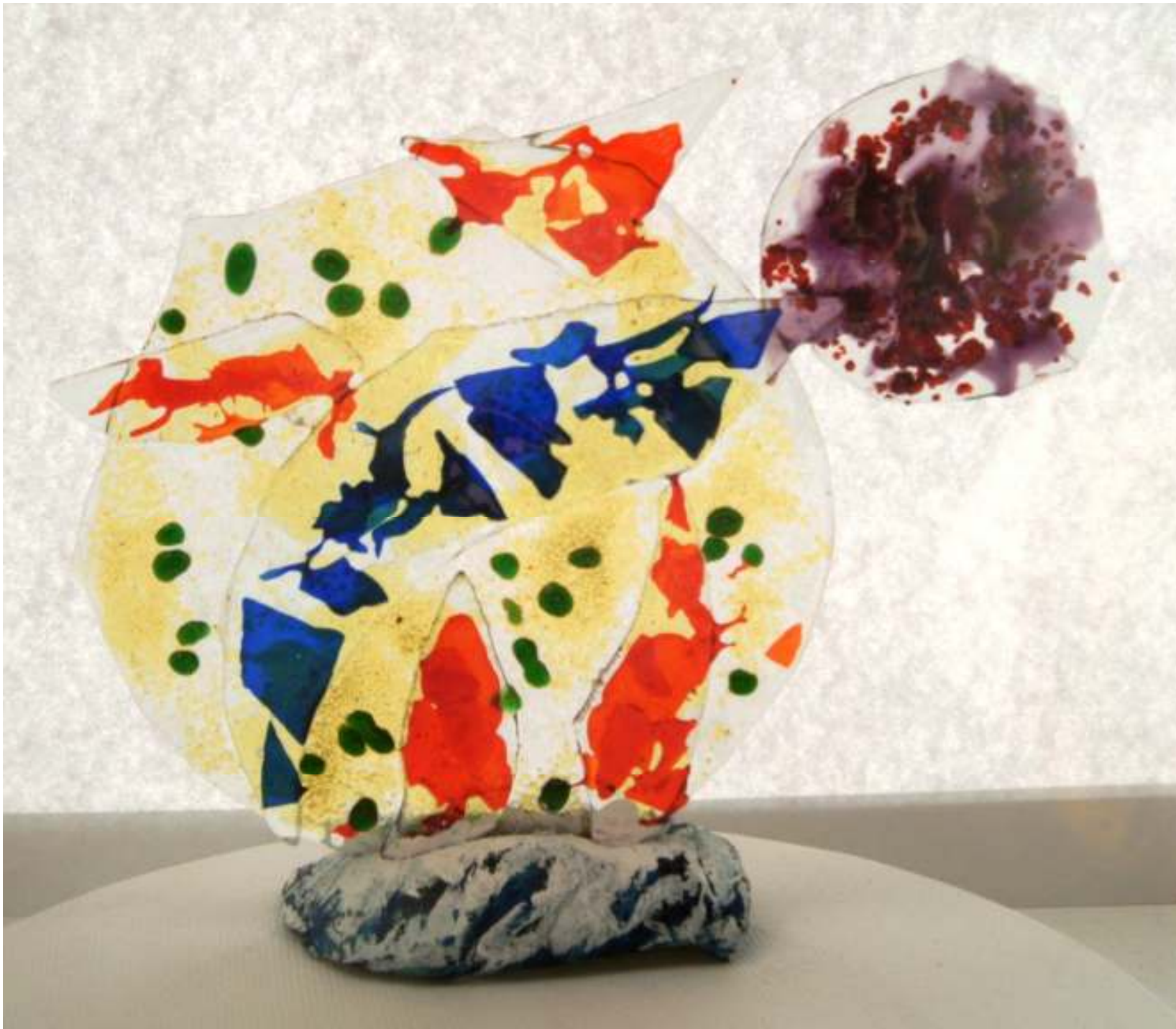
Dolphin and Ball. Plain glass with additional colourings. 2009. 13cm H x 17cm W. Mounted in a hand painted clay base.