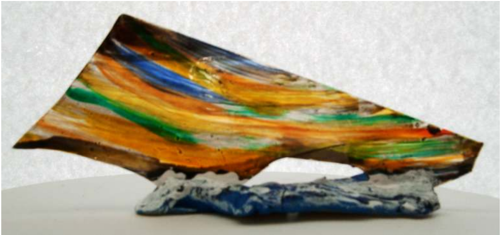
Straight Finned Fish. 2009. 15 x 7 cms. Hand painted glass piece. Mounted in a hand painted clay base. £30