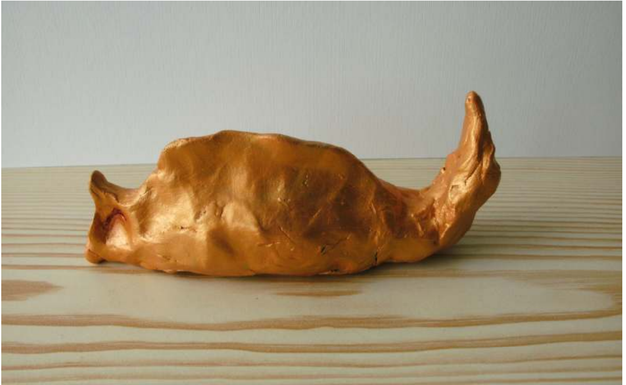
Sail Backed Rhino Slug. 2010 5H x 15L X 5W cms. Hand painted aired dried nylon based clay. £20