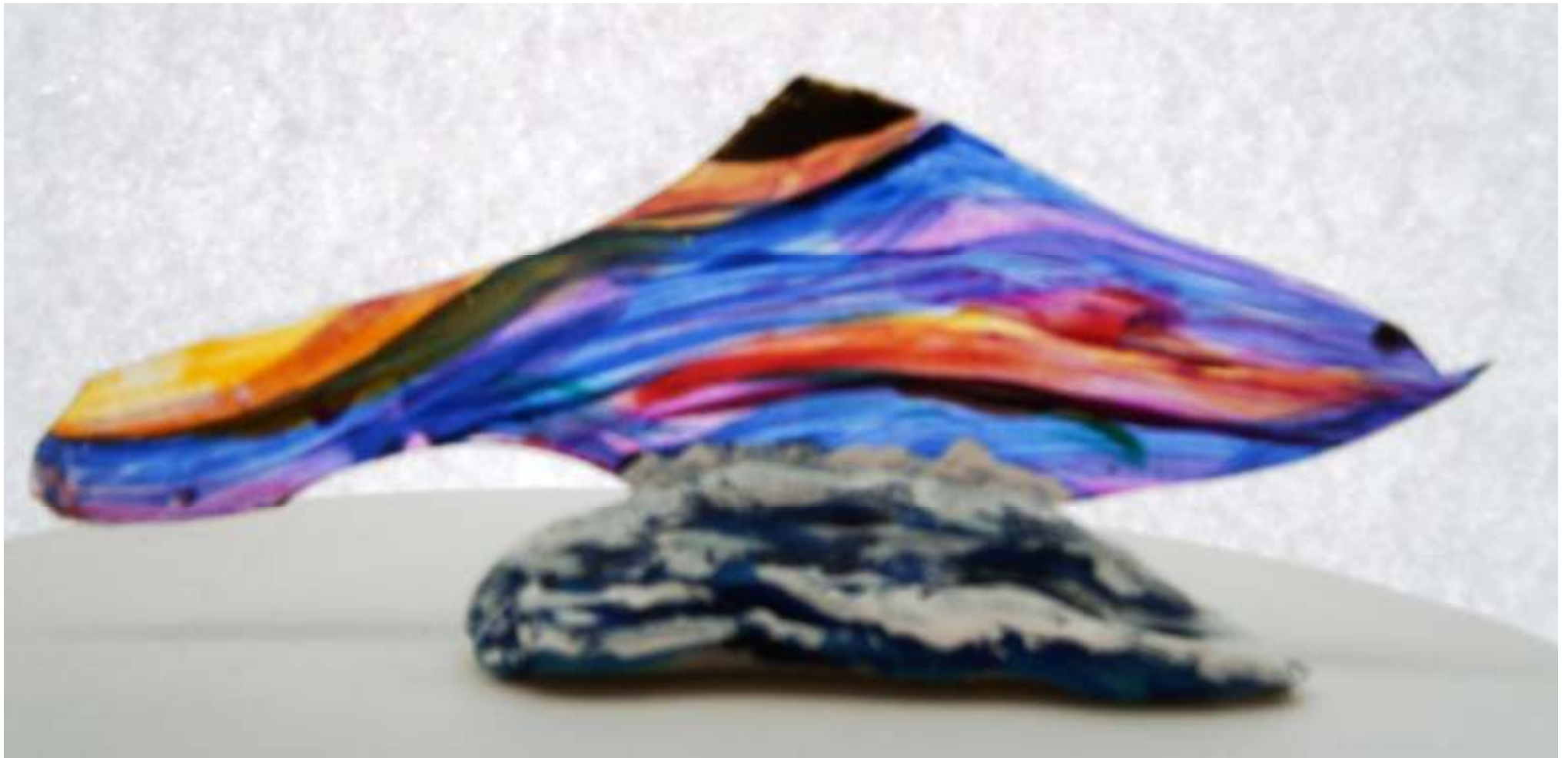
Hook Lip Fish. 2009. 15 x 6 cms. Hand painted glass piece. Mounted in a hand painted clay base. £30